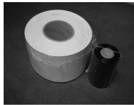
Figure 3: Rolls of 4 inch spun bound polyester media and SDR ribbon as obtained from Alpha Systems. Both are shrink wrapped to prevent dust and dirt accumulation.