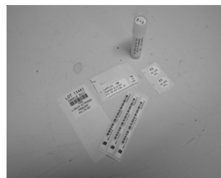
Figure 6: KUNHM Ichthyology peel-and-present labels (various sizes) used for applying to tissue cryogenic vials.