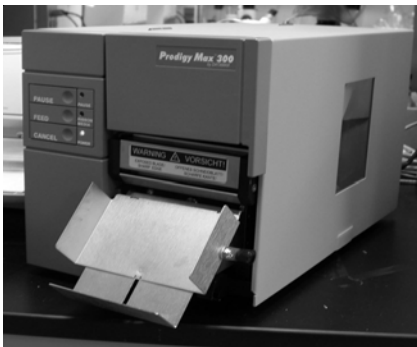
Figure 1: Datamax Prodigy Max 300dpi thermal transfer printer showing front mounted optional cutter.

Another good source for printers is Label Match (110 W. Streetsboro St., Unit 1-C, Hudson, OH 44236; (800) 726-7334; http://www.labelmatch.com ).