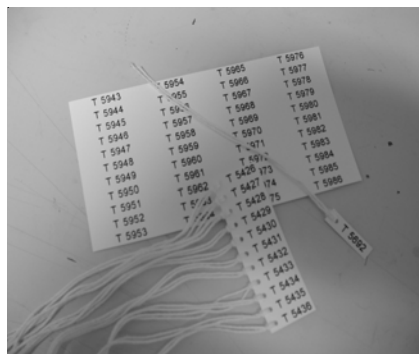
Figure 5: KUNHM Ichthyology tissue labels printed in four rows, cut, hole-punched and threaded for attachment to voucher specimens.